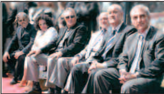
September 7, 2009 in Toronto's "Little Italy", Canada. In front of the CHIN Building