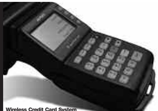
Wireless Credit Card System